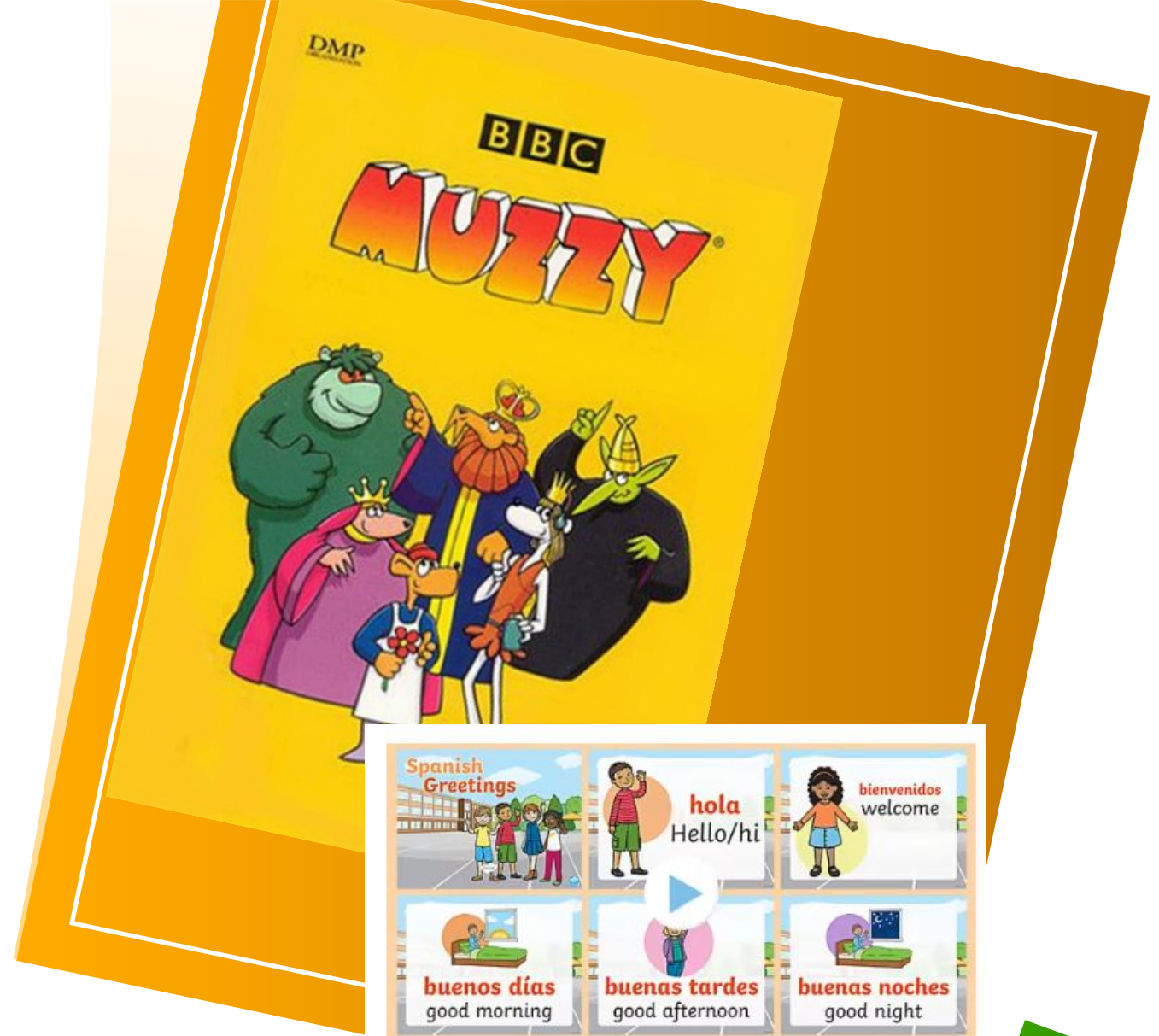
Spanish Greetings PowerPoint