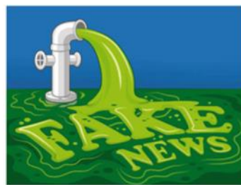
A Parent's Guide to Fake News