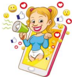
A Parent's Guide to Online Influencers