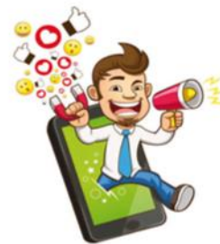
A Parent's Guide to Live Streaming