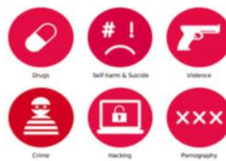
A Parent's Guide to Privacy Settings

Online safety is when young people know who they can tell if they feel upset by something that has happened online.