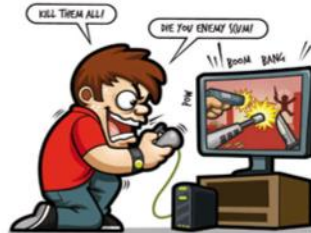
A Parent's Guide to Gaming