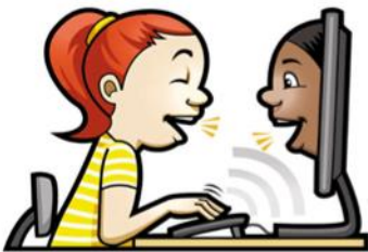
A Parent's Guide to Social Media