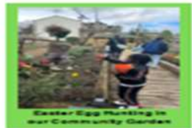
Easter Egg Hunting in our Community Garden

Young Farmers Summer Term 1 kicked off to a great start this April as well, with 10 young farmers keen to learn how we care for our animals and how we maintain the welfare of all our furry friends.