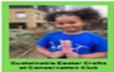
Sustainable Easter Crafts at Conservation Club

Take a look at our range of workshops, that are designed specifically to complement your syllabus and can be tailored to any key stage. Our full list of workshops are HERE .